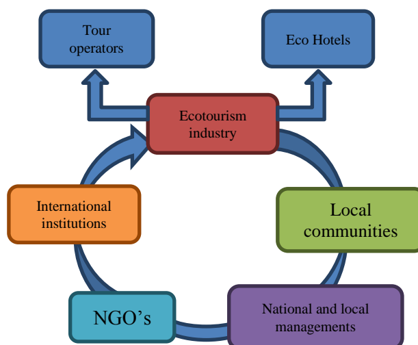
Figure 1. Basic elements of ecotourism [2]