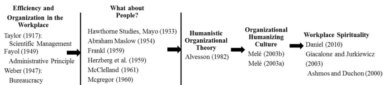
Figure 1. The humanistic approach [6]

- McGregor in 1960 devised two theories X and Y to identify and analyze the behavior and characteristics of schools of classical management and human relations where both are based on a set of assumptions about the individual and the motives and behavior of leadership towards him where the theory presented X and Y theory as another way to understand, motivate and manage staff within organizations Y basically states that people usually accept and seek responsibility, and enjoy mental and physical work duties, and employees believe that work is normal, such as rest or play. Theory X believes that employees don't like work, and that they will try to avoid it whenever possible [1]. The two researchers argue that it is the Y who follow the theory of spirituality in the workplace, unlike the X-theory. More recently, there has been an increase in Y generation followers in international organizations who are said to be more perfect than some previous generations.