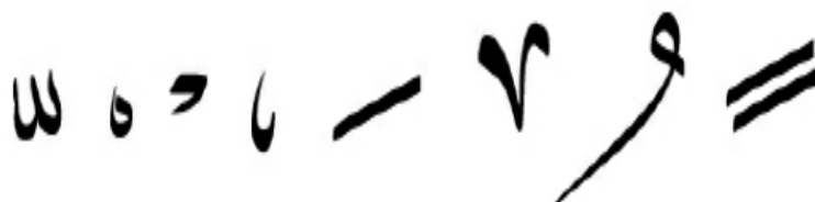
Figure 2. The diacritics have to eliminate

Lastly, the fourth step entails Arabic words' normalization, which is the major step in pre-processing phase due to the fact that the Arabic language has numerous writing shapes. For performing normalization, the suggested approach employs 3 operations: Diacritics removal, Tatwheel removal, and Latter removal. Starting with the removal of diacritics from Arabic word and progressing through the conversion of an alphabetic word to another. Figure 1 shows an instance of such procedure (2). If these diacritics aren't removed, we'll end up with a lot of different shapes for the same words, which is going to make the vector very large and requires more articles to build, which is going to take longer.