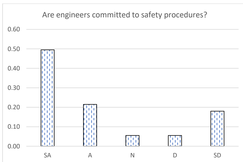
Figure 3. Engineer's commitment to safety rules

The commitment of an engineer to safety motivates others to follow the safety rules and procedures to prevent and/or mitigate the safety issues on jobsites. This statement is supported by 71% of the respondents. While engineer’s ignorance of safety rules does not affect his/her officiality is disagreed by the majority of respondents (92%) and the remaining percent of the respondents was neutral. Ninety-four percent of respondents believe that the engineer should learn more about safety requirements personally. This is a good point to be mentioned as it establishes a safety culture that is needed in developing countries work environment. Figure 3 summarizes the results of the third area, engineer’s commitment to safety procedures.