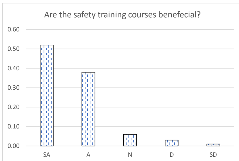
Figure 2. Safety training courses