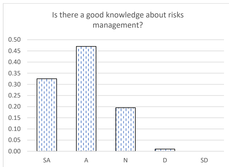
Figure 1. Risk management knowledge

By calculating the response percentages per each question in the first area (risk analysis management), there is a high percent of respondents being neutral regarding SOWT analysis, 50%. While those who have a strongly agreement and an agreement rating are 4% and 46%, respectively. This trend indicates that respondents do not have a good knowledge about one of the important risks evaluating and planning techniques. Regarding the risk matrices, most respondents (76%) have a good understanding about its role, which indicates a positive notion. On the other hand, there is an agreement from the respondents that the data recording regarding safety should be kept (100%), which also shows a supportive insight. The final item in this first area, is the removing of the hazards. A higher percent (92%) agreed that this should be conducted whenever a hazard is identified, which reflects a good sense of risk prevention. To ease following of the total results about the first area, the responses of all questions were summed in terms of the five ratings. Referring to the figure 1 below, it is obvious that the majority have enough theoretical knowledge about the risk management requirements. However, there are some gaps in this kind of knowledge.