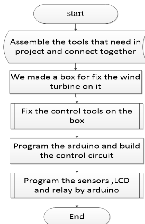
Figure 1. Flowcharts of Methodology

A wind powered generator is designed to simulate the real generator where the wind speed is controlled by controlling a constant D.C Motor with a speed sensor. As a result, the speed of rotation simulates the speed of the wind which the Arduino program controls. This makes the speed almost constant entering into the generator as seen in the chart below: