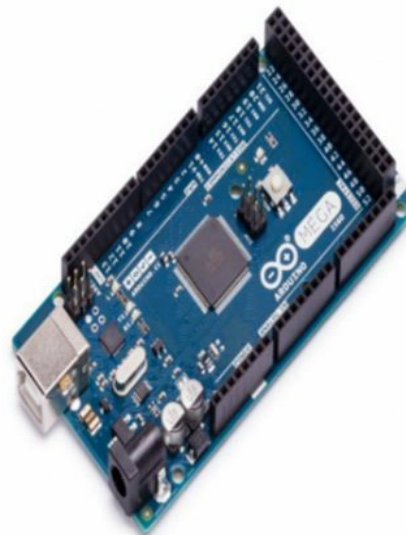
Figure 2. Arduino Mega

Voltage of operation:5v Inputvoltage (recommended):7-12v Limits of Input voltage :6-20v Digital I/O pins:54(of which 15 provide PWM output Analog (input) pins:16 DC current per I/O pin :40mA DC current for 3.3v pin :50mA Flash memory :256KB SRAM:8KB EEPROM:4KB Clock speed :16MHZ