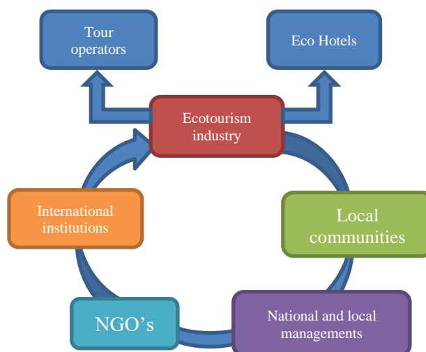
Figure 1. Basic elements of ecotourism [2]